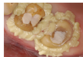
Place Traxodent over the cord. Wait 2 minutes and rinse.