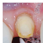
After 2 minutes, Traxodent easily rinses away.