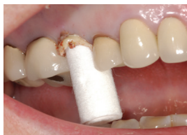
Syringe Traxodent; place retraction cap; have patient bite down for 2 minutes.