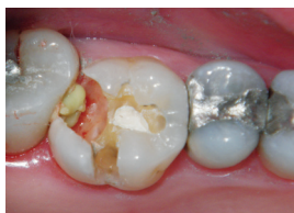
Old restoration is removed; Traxodent is applied.