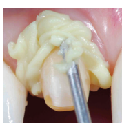
Traxodent is applied around prepared tooth.