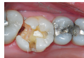
After 2 minutes, bleeding is stopped and field is isolated.