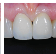
Final CAD-CAM restoration.