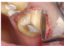
A single retraction cord is packed around the preps.